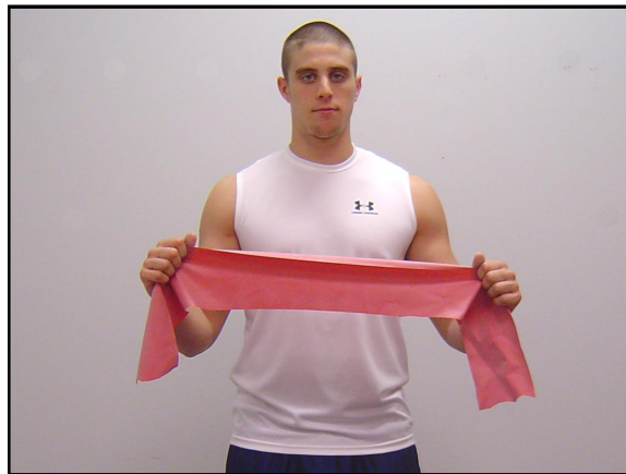
Figure 1-3. The resistance or exercise band.

This is an outstanding product that has a very unique physical property known as a hyper-elastic potential . This means that the more you stretch the band the more resistance you will have to apply. The amount of resistance found within an elastic band is therefore a function of its length when stretched. When used properly, the resistance band is the ideal speed training device.